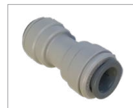
3/8" — 3/8" Straight JG Push-Fit Connector