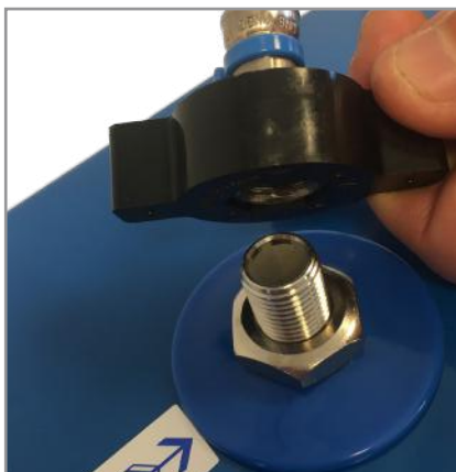
Attaching the water outlet hose (blue)